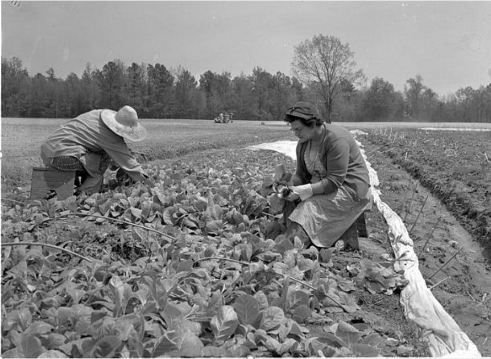
A white family planting tobacco in Rhodesia in 1958 at their family farm taken from Africans